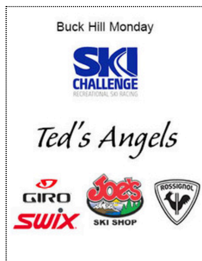
Table Toppers placed on team tables at League Events