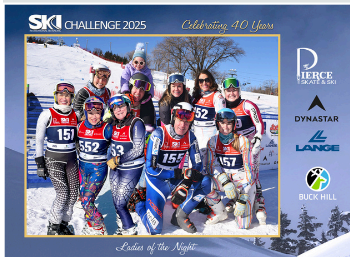
Ladies of the Night

Professional 5x7 Team Photos are taken and made available for each member at no additional charge to them. These photos are also used in award plaques given to the winning team of each league and the winning team in each championship division.