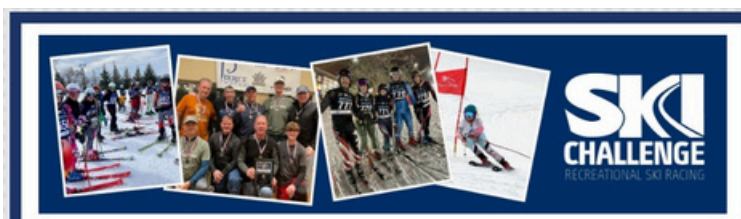
Ski Challenge | Final Week / Championships - 2025

Printed News - Distributed at all events and participating sponsor shops