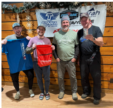
League Event Awards

Indoor and Outdoor banners are displayed at each event. All banners are displayed at our Championships at Giants Ridge giving all sponsors great exposure.