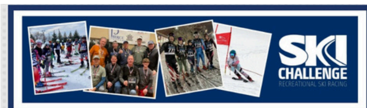
Ski Challenge | Week 2 - 2025