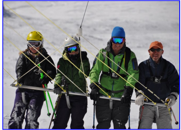
Portillo's famous "Va et Vient" lift